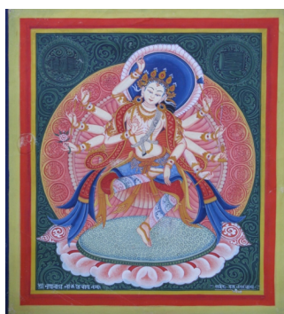
Padmanateshvara Initiatory Deity of Charya Dance

Nepalese mandala dance and Indian prayer dances